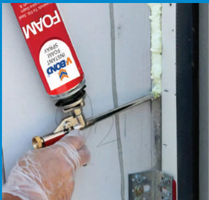
PU FOAM ADHESIVE